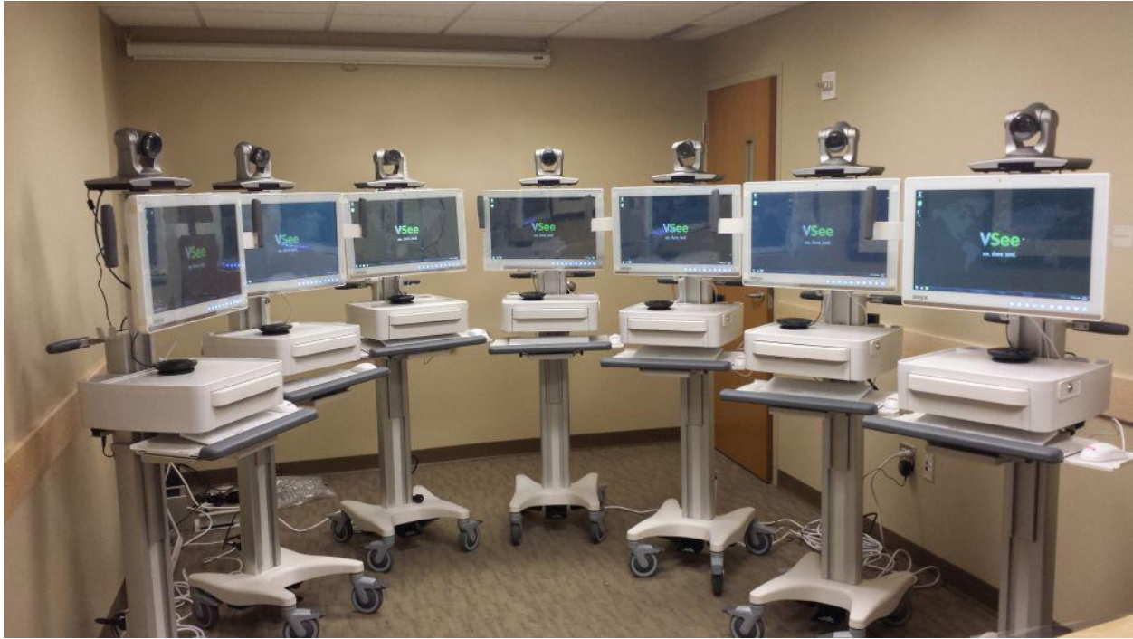
All VSee telemedicine carts were assembled on-site by VSee staff.